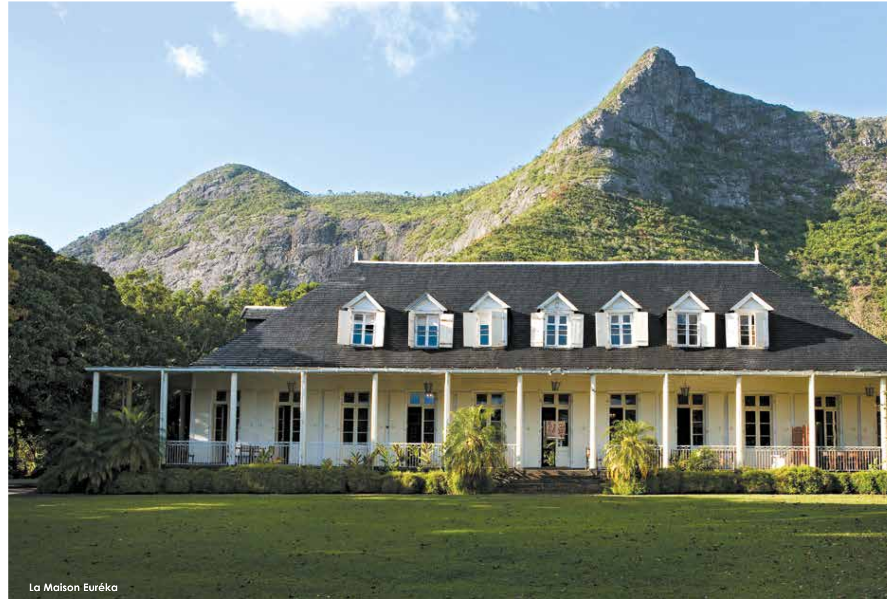
La Maison Euréka

Opening Hours: Monday to Friday, 9.30 a.m. to 3.30 p.m. mauritiuspost.mu/postal-museum Tel.: +230 208 0033